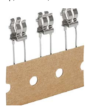
Clip, 5 x 20 mm, Version 1