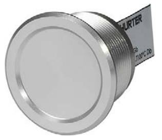
PSE 19 EX