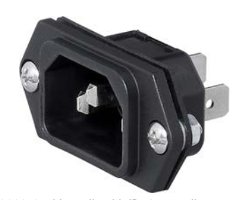
6100-3 with sealing kit IP54 to appliance (without locking brackets)