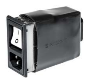
RC320 Rear Cover for Power Entry Module