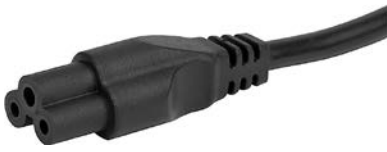
IEC Appliance Outlet C5 black