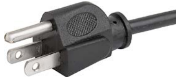
Power plug North America