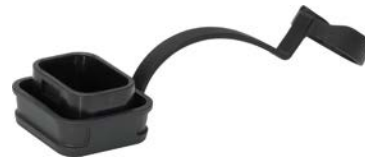
Protection cover black for IP67 / IP69K for 4762