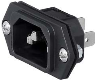
6100-3 with sealing kit IP54 to appliance (without locking brackets)