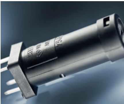
FPG4 fuseholder

The fuseholder standard IEC/EN 60127-6 has been revised to improve fire safety. Effective in October 2017, manufacturers of fuseholders will only be permitted to market products that have been tested and authorized in accordance with the updated standard. SCHURTER will offer its customers upgraded solutions by the deadline.