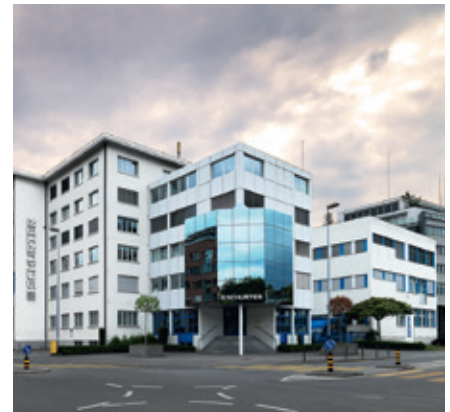
Headquarters in Lucerne