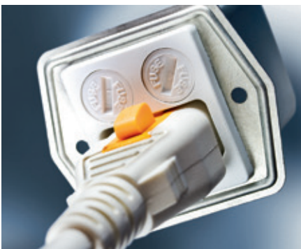
5707 entry module with fuseholder

According to the new standard, all fuseholders and all appliance power entry modules with fuseholders can be used in all household appliances since they now are also glow-wire resistant. With the increase in the requirements the fire safety of all electrical appliances has thus been improved.