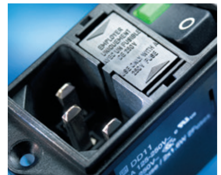
DD11 entry module with fuse drawers

The manufacturers of fuseholders and appliance inlets with integrated fuseholders must test the glow-wire resistance of the used materials and replace the materials used with new glow-wire resistant material if need be. Furthermore, the marketing authorizations must be updated and a supplementary test according to the IEC 60127-6 standard performed by the VDE certification authority. In the event of a change in material to achieve the increased temperature requirements, the material tests according to UL 4248.1 must also be repeated. An important aspect is also the verification of the temperature increases in the new installation position and if needed - the implementation of technical upgrades to meet the updated standard. The manufacturers are required to change the material logistics, documentation and production accordingly.